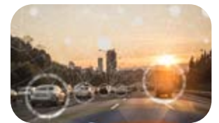
IoT/IoV & Optoelectronics