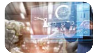
Industrial & Medical