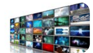
Flat Panel Display