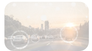
IoT/loV & Optoelectronics