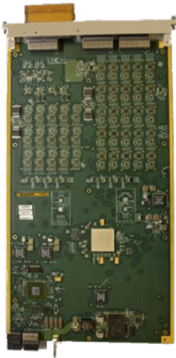
PD1x / PD2x

Test Solution for Ultra-High Definition Display Driver ICs