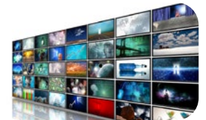
Flat Panel Display