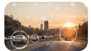
IoT/IoV & Optoelectronics