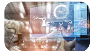
Industrial & Medical