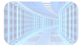
Computing & Network