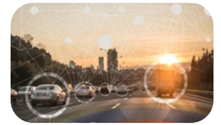
IoT/IoV & Optoelectronics