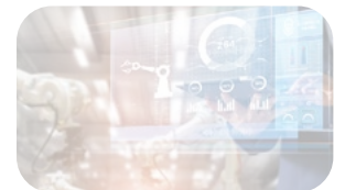
Industrial & Medical